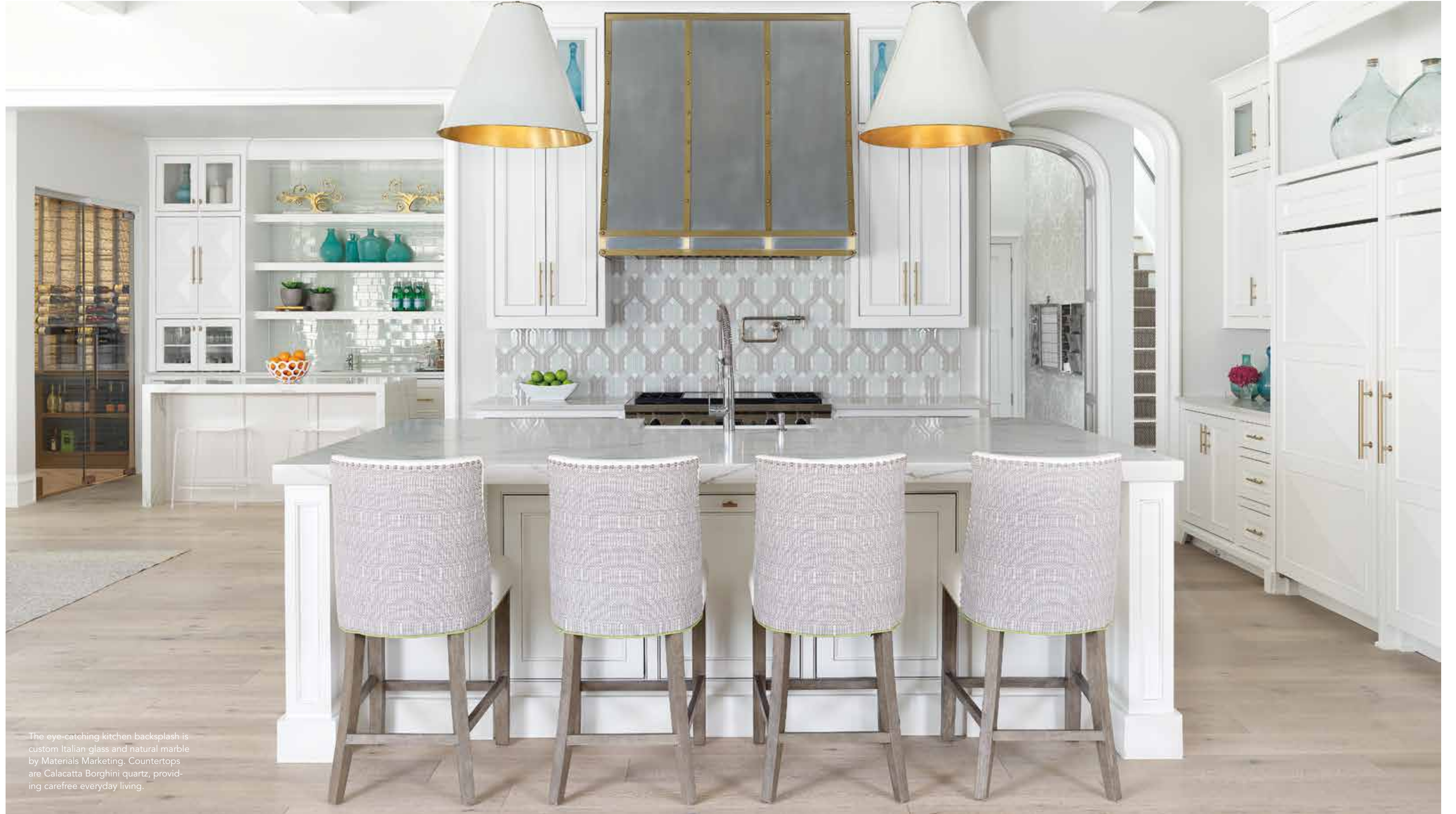
The eye-catching kitchen backsplash is custom Italian glass and natural marble by Materials Marketing. Countertops are Calacatta Borghini quartz, providing carefree everyday living.