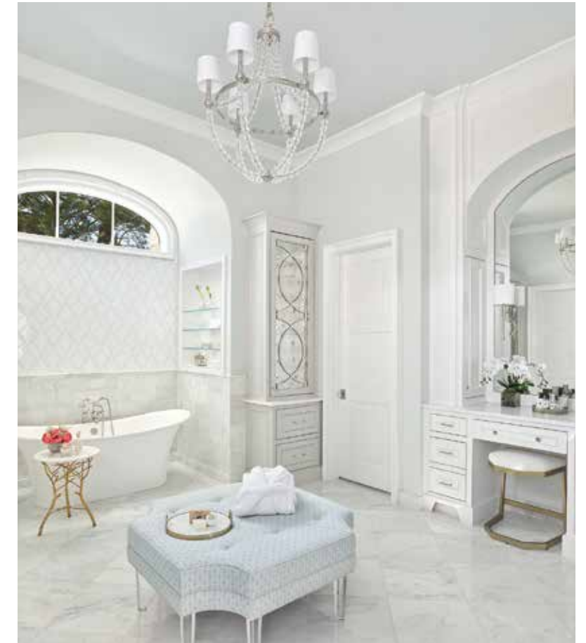
Left: A stately upholstered bed sits next to a vintage armoire inherited from the husband's family. Artwork above the bed, commissioned from Justin Gaffrey, depicts a nest with three blue eggs, representing the owners' three children. Above: Elegant bands of interlocking ribbons feature white thassos marble and luminous natural white rivershell from the Claridges collection from Artistic Tile to create the focal wall behind the tub.

Chairs flanking the dining table are covered in performance Perennials fabric and Robert Allen faux leather. Nailhead trim adds a classic touch. DeLeo used a Calacatta Borghini quartz on the kitchen countertops to allow for everyday mishaps without worry. The custom glass and natural marble backsplash provides an artistic, graphic touch above the Wolf range.