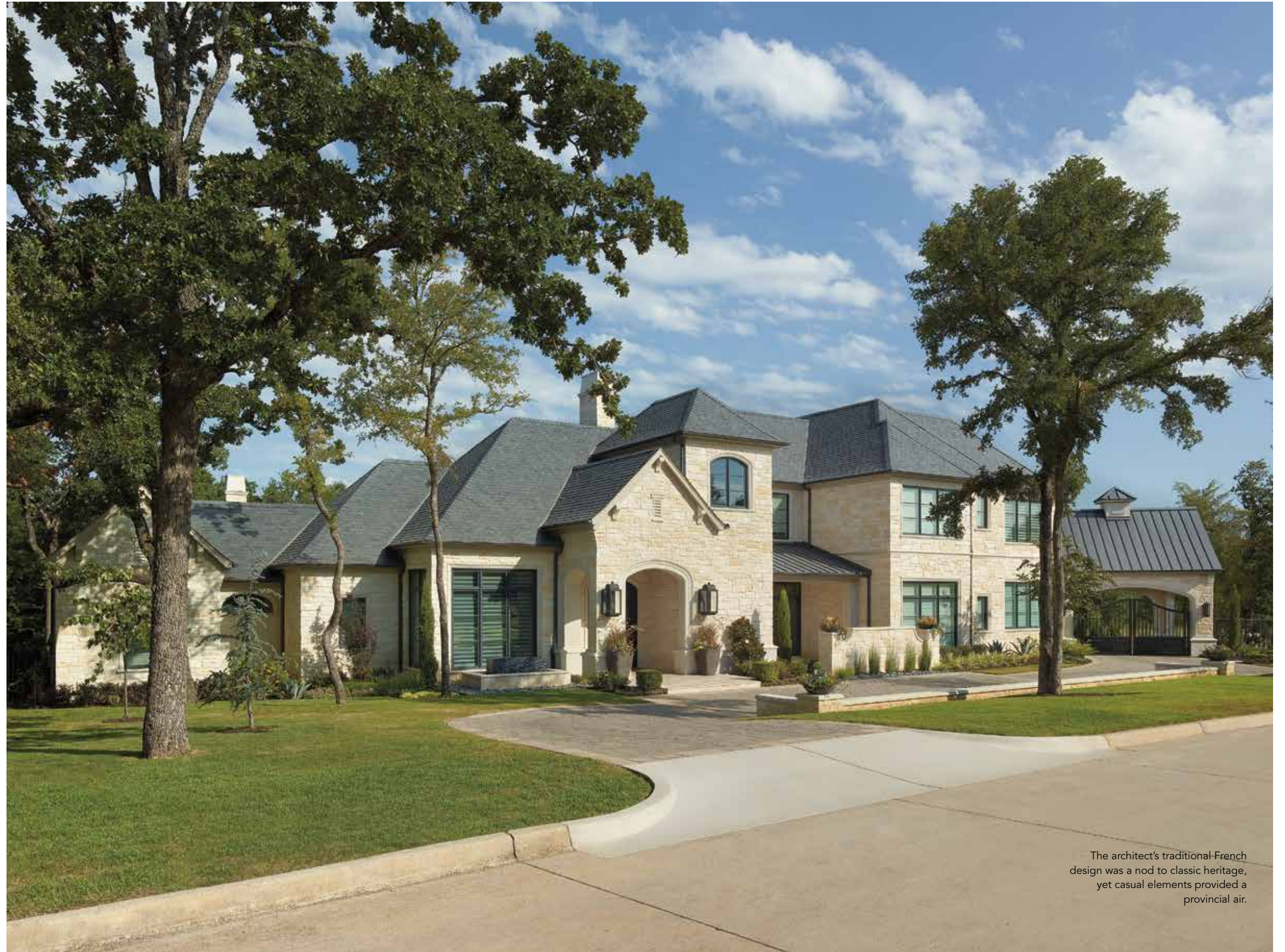
The architect's traditional French design was a nod to classic heritage, yet casual elements provided a provincial air.